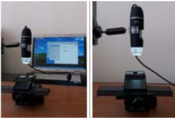
Fig. 1 A377 Digital camera used for the photomicrographs