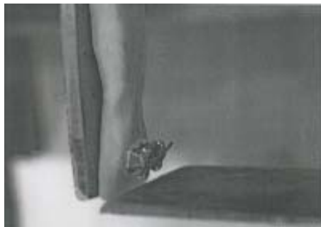
Fig. 5. Bracket position for accidental debonding