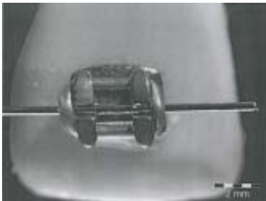
Fig. 1. Apex MX Opal bracket installed on the tooth surface with wire and silicon ring

the natural habits are difficult to inhibit mostly regarding the incisors which represents the most important tool in initial mastication and generally are the most affected by various positioning defects and therefore subject of orthodontics. As human incisors are difficult to procure present study purpose the use of alternate solution in order to analyses the mechanical behaviour of tooth-adhesive-bracket system in laboratory conditions.