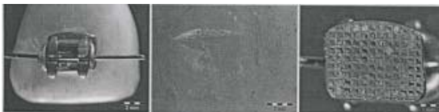
Fig. 3. Microscope photos before and after debonding. The fracture of the composite may be observed

For this study the twenty tooth simulators were gripped on an universal testing machine from CTR being fixed along a steel stripe in order to avoid the natural bending of the bone during the test (fig. 4. and 5.). The force at break was measured at a speed of 0.5 mm/s. Twenty teeth made from bovine bone were tested and the results are shown in