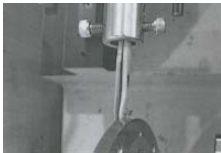
Fig. 4. Gripping of tooth simulator