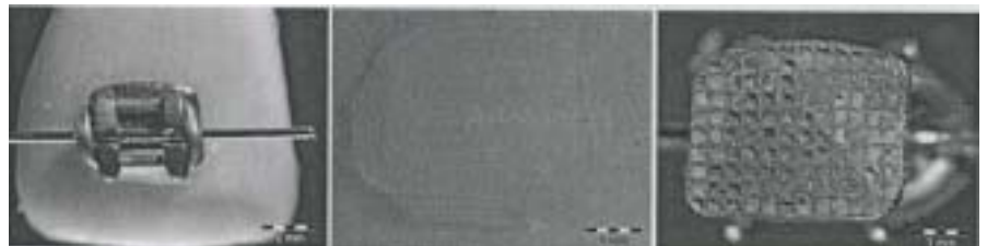
Fig. 2. Microscope photos before and after debonding. Almost entire amount of the composite remained on the tooth surface

Bovine rib bones were human incisor shaped after conditioning and the brackets were installed on them such as the obtained systems can be easily gripped on the universal testing machine. The use of bovine bones allows repeated use of same system including cases of wrong positioning, insufficient etching, various quantities of