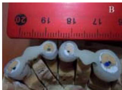
Fig.1. Horizontal section: Visualizing the cement layer

They also act by releasing the fluoride from the microorganisms. There are cements that allow the adhesive cementation of crowns and bridges. Bonding the cement to the dentin can be achieved by offering a fraction of the power of obligations compared to fusion. The plaque formation on the composite surfaces is a disadvantage of the cements [7].