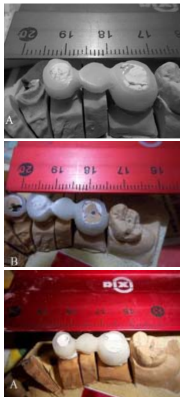
Fig.2. Horizontal section: Visualizing the adaptation of the cement on the abutment A, B.

For the marginal area has been obtained acceptable average value. The higher values than in other studies are because the measurements were made on bridges. The slight expanses in the interdental area show in this case a negative result in the column area (fig.2). Beside this, the bridges were not made by the dental technician in the laboratory but of producers which do not have a routine with these devices. For technical reasons there has not been analyzed circular the marginal area, only the proximal area. A large part of information has been lost because of