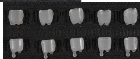
Fig. 3. Brackets after debonding: Upper row-Group 1, Lower row-Group 2

APC Flash-Free brackets are individually packed and for bonding it only needs correct positioning and pressing on the tooth surface, saving valuable time. The time obtained in this study was approximately 20 s, half the time needed for bonding brackets by the traditional technique. Similar results were found in other studies with a time difference of 10 s [13] to 20 s [14] between groups. Adhesive excess that needs to be cleaned before curing disturbs the position of the bracket, implying more time for a correct placing.