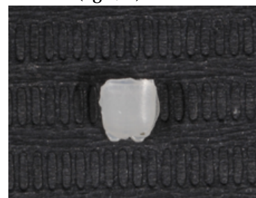
Fig. 2. Clarity advanced (uncoated) bracket after debonding.

Adhesive remnant index values are 0 for all samples showing the low adherence on the resin tooth surface when no pretreatment is applied (table 5). Considering that the entire adhesive was separated from the resin crowns, on the images obtained after debonding, it can be observed the flash of adhesive present in Group 1, of uncoated brackets (fig. 2, 3).