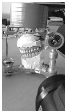
Fig. 2. The occlusal load is of 39.2 N

We performed the occlusal records with those materials successively, the materials being applied on the occlusal surface of the lower arch. During the recording procedures, the articulator was closed and on its upper arm the standard weight of 39.2 N (approximately 4 kg) was placed. After