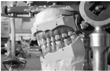
Fig.3. The measurement of the distance between the standardized anterior and posterior marks using Adobe Photo Shop application