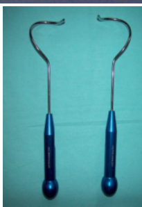
Fig.2. Needle device used in TOT