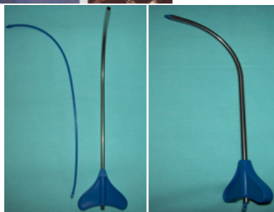
Fig. 3. Needle device used in TVT technique