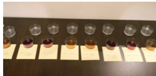
Fig. 1. The samples immersed in coffee solution and red wine

The samples thus obtained were stored in saline water for 24 h and subsequently divided into three groups: group I (subjected to ICON infiltration resin therapy), group II (subjected to remineralization therapy with Recaldent MI Varnish), group III (subjected to sealing with Grandio Seal nanohybrid composite resin). The application of the products was performed according to the protocol indicated by the manufacturer. Each group contained 50 samples, divided into 5 subgroups (5×n = 10). In the study subgroups Ia, IIa and IIIa the samples were subjected to red wine (A) action, in Ib, IIb and IIIb were subjected to coffee (B) solution action, in Ic, IIc and IIIc were subjected to cigarette smoke (C) action, in Id, IId and IIId were subjected to the mixed effect of the three colorants: coffee, red wine and cigarette (D), and in Ie, IIe and IIIf the samples were kept in artificial saliva (E) as control group and subjected to any coloring action. The coloring protocol complied with the following conditions: immersion in a colorant at 37°C, under dark conditions for 24 hours, 7, 14 and 21 days, respectively.